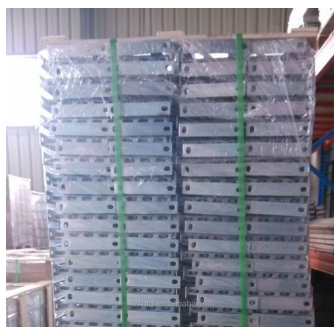
2. Suitable carton size