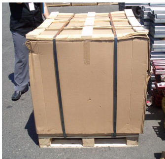
3. Shock bubble film