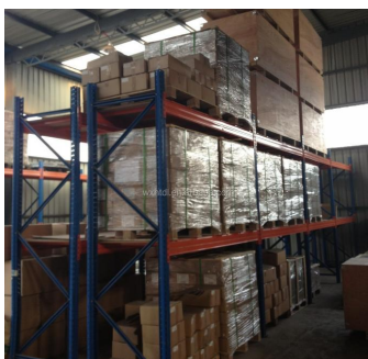
1. Special logistics packaging

Delivery Details : 3-30 days after order of Solid bicycle tire tubes